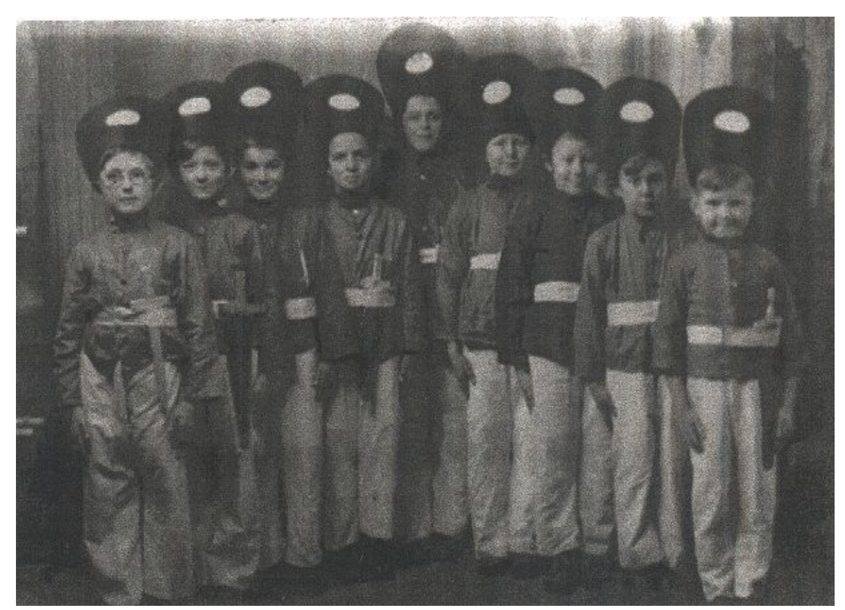
School concert in village hall Dec 20 1950